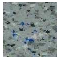
RHE0069 gray-blue large