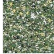
RHE0062 green-yellow fine