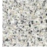
RHE0063 gray-black fine