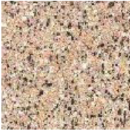
RHE0060 champagne-rosé fine