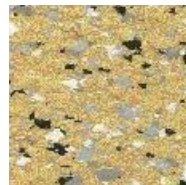
RHE0068 yellow-black large