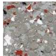
RHE0070 gray-red large