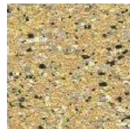
RHE0067 yellow-black fine