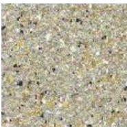
RHE0066 champagne-beige fine