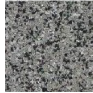
RHE0064 black-gray fine