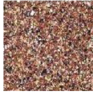
RHE0061 red-yellow fine